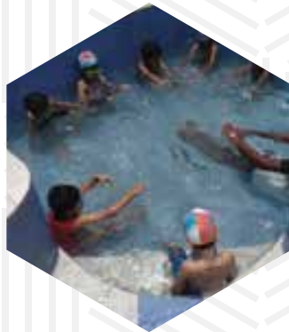
Refreshing Splash Pool