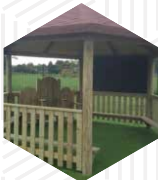
Traditional Story Telling Areas