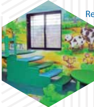
Virtual Writing Rooms