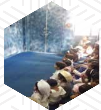
Thrilling Audio Visual Hall