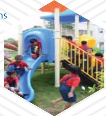
Wonderful Play Park