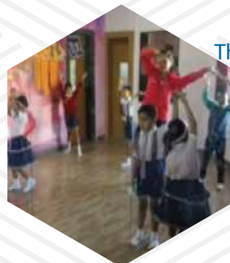
Spacious Dance & Music Rooms