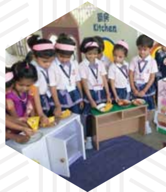
Joyful Theme Rooms