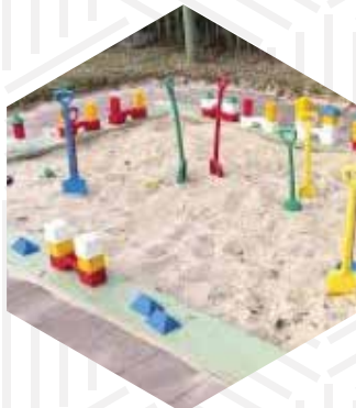
Breezy Sand Pit